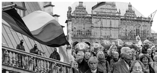
October 3 – Unification Day. Chancellor Merkel on the highly secured town-square of Bremen addresses a speech to a chosen audience. All other assemblies were prohibited. Nonetheless, some members of the FDJ got to the town-square and opened up 7 umbrellas saying: GDR lives!

What makes the capitalists sleepless nights in this crisis are, that with the former socialist bloc, millions of capitalist's gravediggers were conquered. Workers, peasants who had already begun to build up a socialist society. Although, the majority of these gravediggers does not see its potential today and has not started to struggle for their future yet. Nevertheless, the FDJ unwaveringly struggles against the annexation of the GDR in both annexed GDR and FRG.